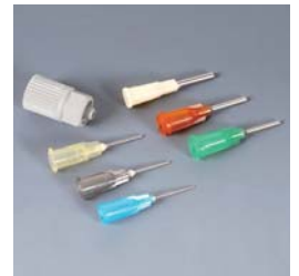
992X Nozzle Adapter and Needles