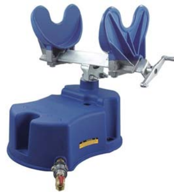
Model 7000 Mixer