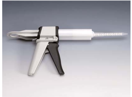
9700 50ml Dispense Gun

Larger cartridge sizes including 75ml, 200ml and 400ml are available upon request.