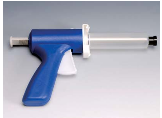
8200 30cc Dispense Gun