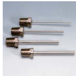
8535, 8540, 8545, 8550 Stainless Steel Needles