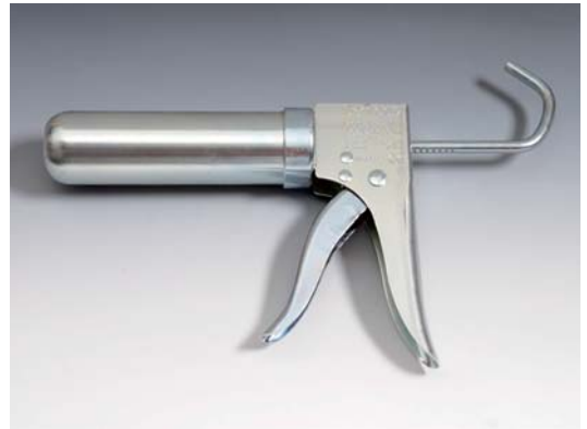
8500 6 oz. Dispense Gun